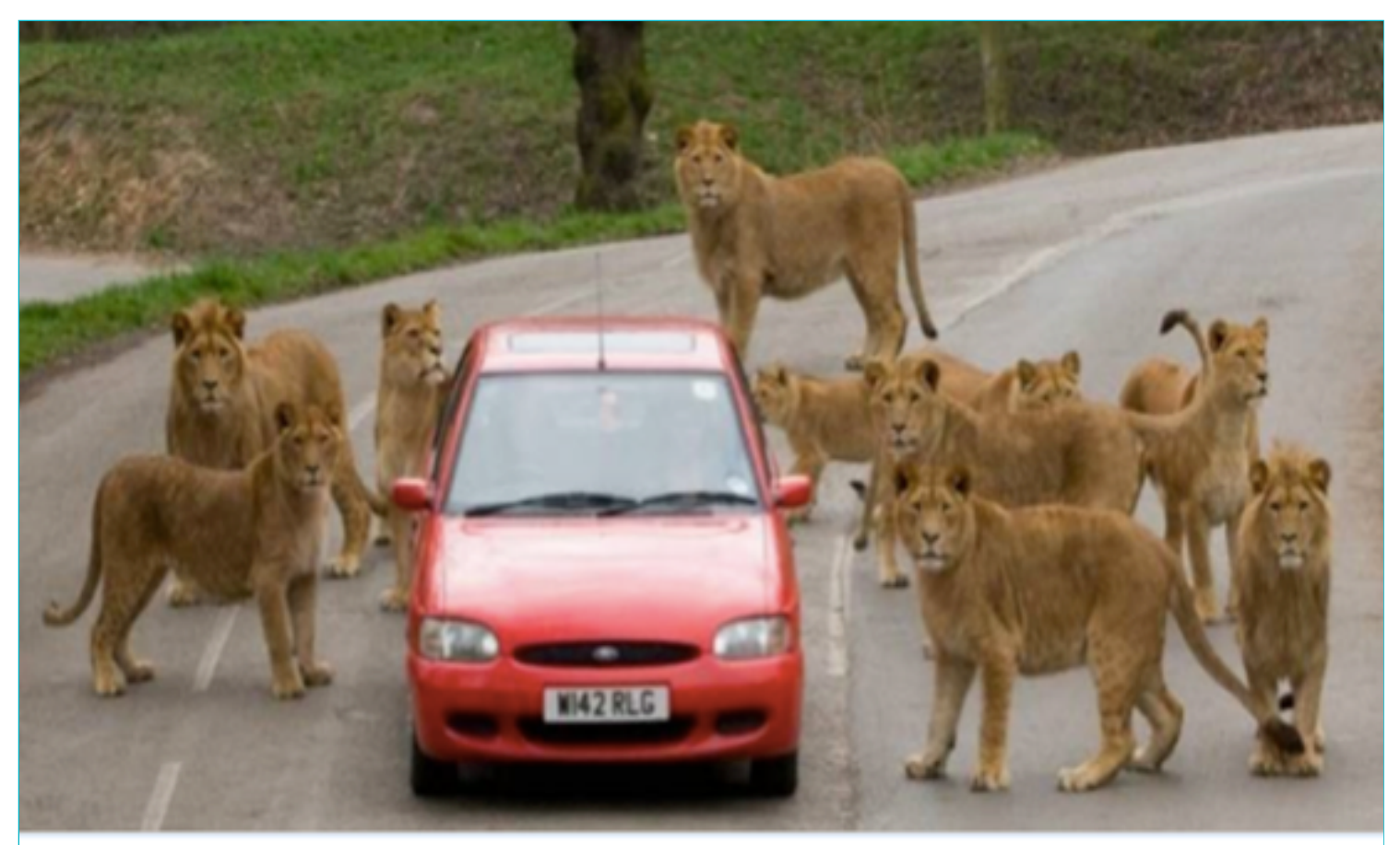
Our roads will be just a bit different: Our vehicles will be much larger. But we may just encounter a family like this! :>)