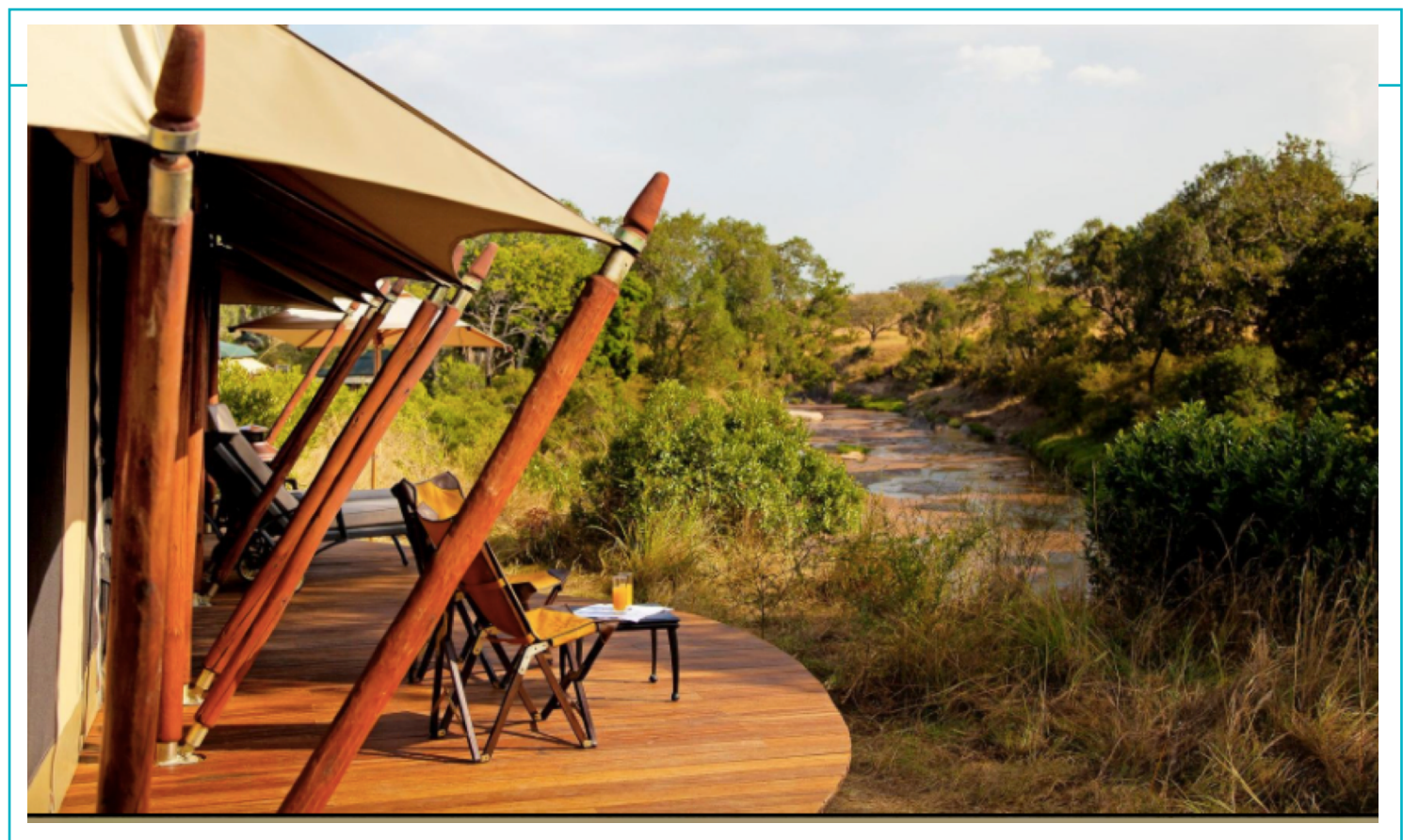
This is the Sand River (doesn't look like much). It runs through Kenya and Tanzania.

I'm pretty sure none of you are saying, "Oh,Boy! Cape Buffalo!!! Let's go to Kenya so we can see them up close!" So here are a few of the other animals you'll see >>> That's Lion Day Care at its finest! :>)