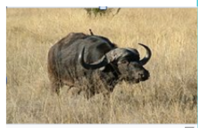
African Cape buffalo

Last time we talked about the Big 5 - specifically the African Bush Elephants ... this week we go to #2 - The African Cape Buffalo! It's big, it's not too pretty, and there are a lot of them around!