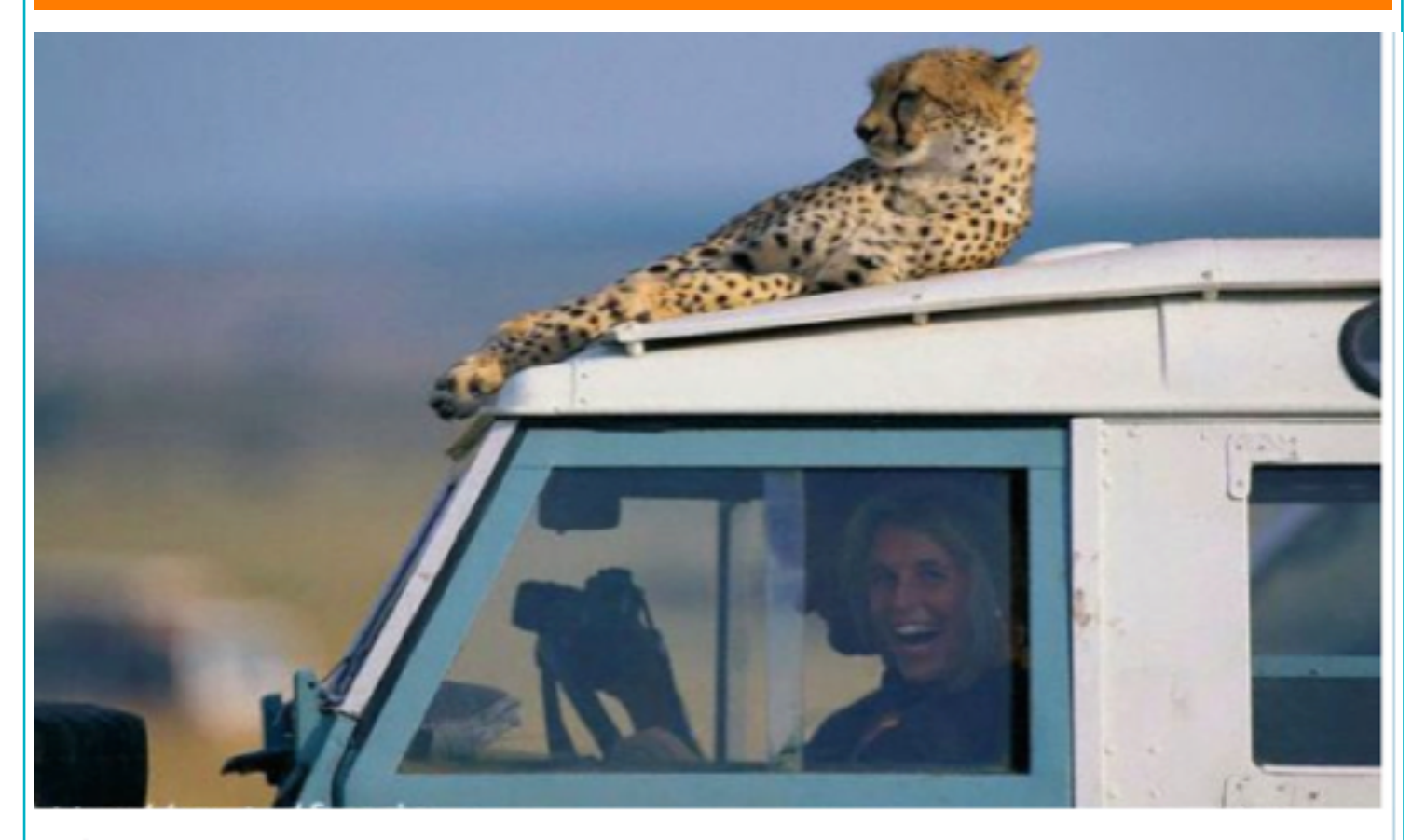
Ya' Never Know!!!

Along the way, we will never know what we will see!!! BUT, we will NOT be in any danger as long as you pay attention and listen to our driver! Our driver(s) are also our guides and interpreters. They speak both English and Swahili ... amazingly, they will find animals that you won't see until you're told where to look! They may stop the vehicle at anytime, seemingly for no reason. Be patient! Before you know it something will appear ... you may be near high grass and won't even see it move, then suddenly a lion (or 2) will walk out in front of your vehicle. These men know their country and what to look for. You may hear Swahili over the radio, generally it's one driver telling another what he's found and where to get to so his guests can see it. Trust him, he's knows what he's doing! That's why we tip them at the end of our visit! :>)